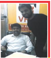
AYUSH SINHA IAS 2017