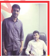
ABHISHEK KHANNA IAS 2017