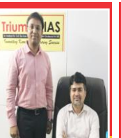
TEJAS N. PAWAR IAS 2017