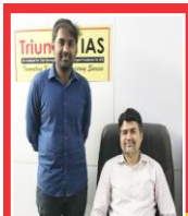
KOYA SREE HARSHA IAS 2017