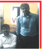
ADITYAVIKRAM HIRANI IAS 2017