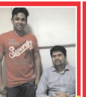
ANSHUL SINGH IAS 2017